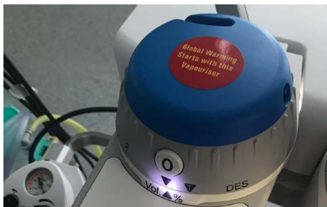
Figure 1: simple visual reminders can be a powerful form of departmental advocacy (photograph used with permission. Credit: Dr Oli Pratt)